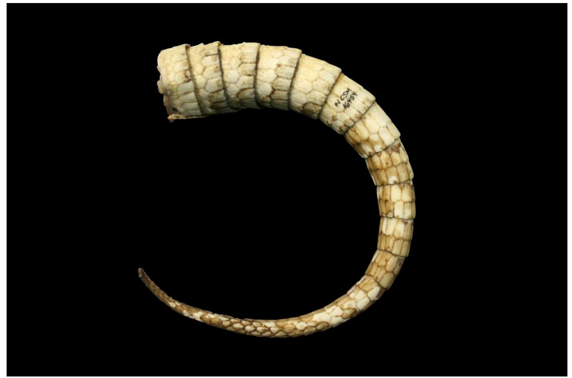
Modern armadillos (like the nine-banded armadillo shown here) have flexible tails covered in bony rings, but some of their extinct relatives, the glyptodonts, had stiff tail clubs that might have been used as weapons.

Royal BC Museum 675 Belleville Street Victoria BC V8W 9W2 royalbcmuseum.bc.ca